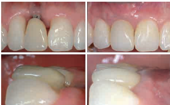
before and after implants

Esthetic mucogingival surgery around implants: treatment and prevention of esthetic failure around implants